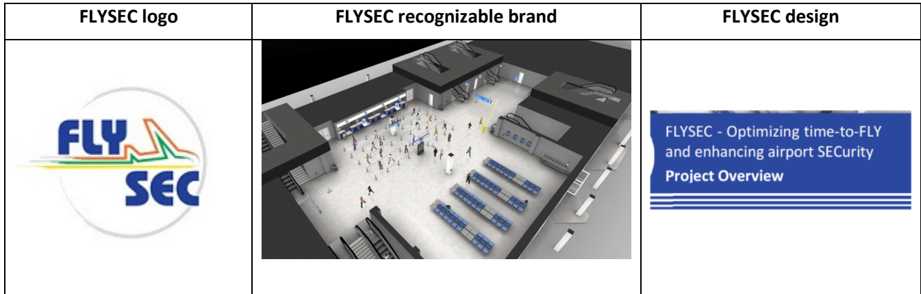
TABLE 8 - FLYSEC CORPORATE IDENTITY

A corporate identity is being developed to give FLYSEC a recognizable brand that will be used across all project communications. It includes a project logo, graphic charter, and colour definition, dedicated templates for PowerPoint and word usage.