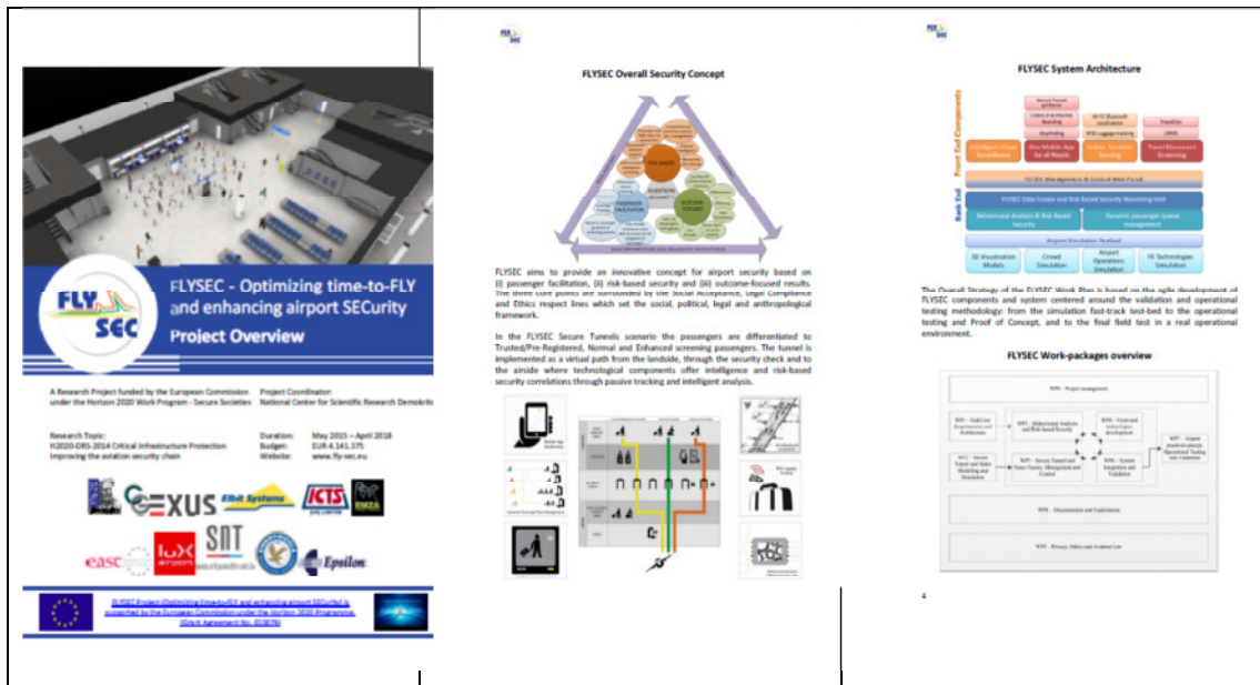
TABLE 9 - FLYSEC OVERVIEW PAPER

A standard project presentation will be developed that can be used to present the project at relevant events. It will be updated regularly to include intermediate results and will be adapted to the specific target groups of the respective events. Further, a “two and four pager” will be developed to enable a short and direct approach to target groups with comprehensive information about the project. The short document provides an executive summary of the FLYSEC project, information on the FLYSEC overall security concept, the FLYSEC system architecture and a work package overview. Both documents are already available on the project website: http://www.fly-sec.eu/presentations.html