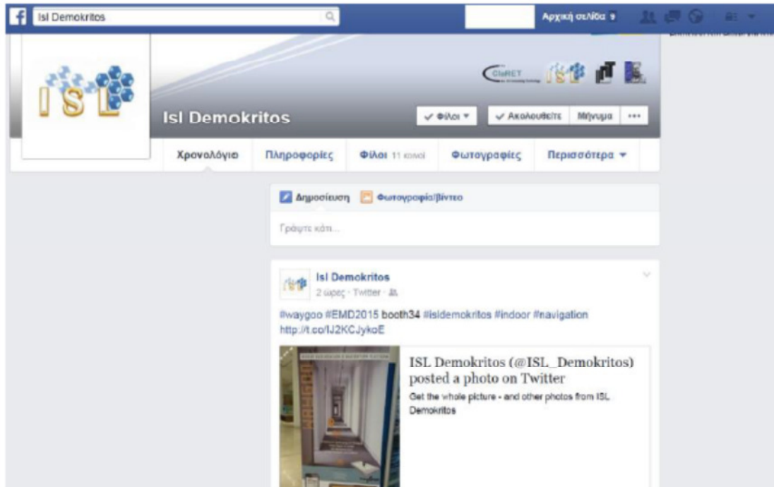
FIGURE 3 - SOCIAL MEDIA PRESENCE

Besides LinkedIn, social media presence will be established and maintained to other popular platforms such as Twitter and Facebook, aiming to promote visibility of FLYSEC public events and information. Besides creating FLYSEC dedicated groups and social media pages, partners will be encouraged to promote FLYSEC and create postings frequently in their own pages and social networks. A first objective of the FLYSEC social media campaign would be to establish visibility and awareness for the www.fly-sec.eu domain and website.